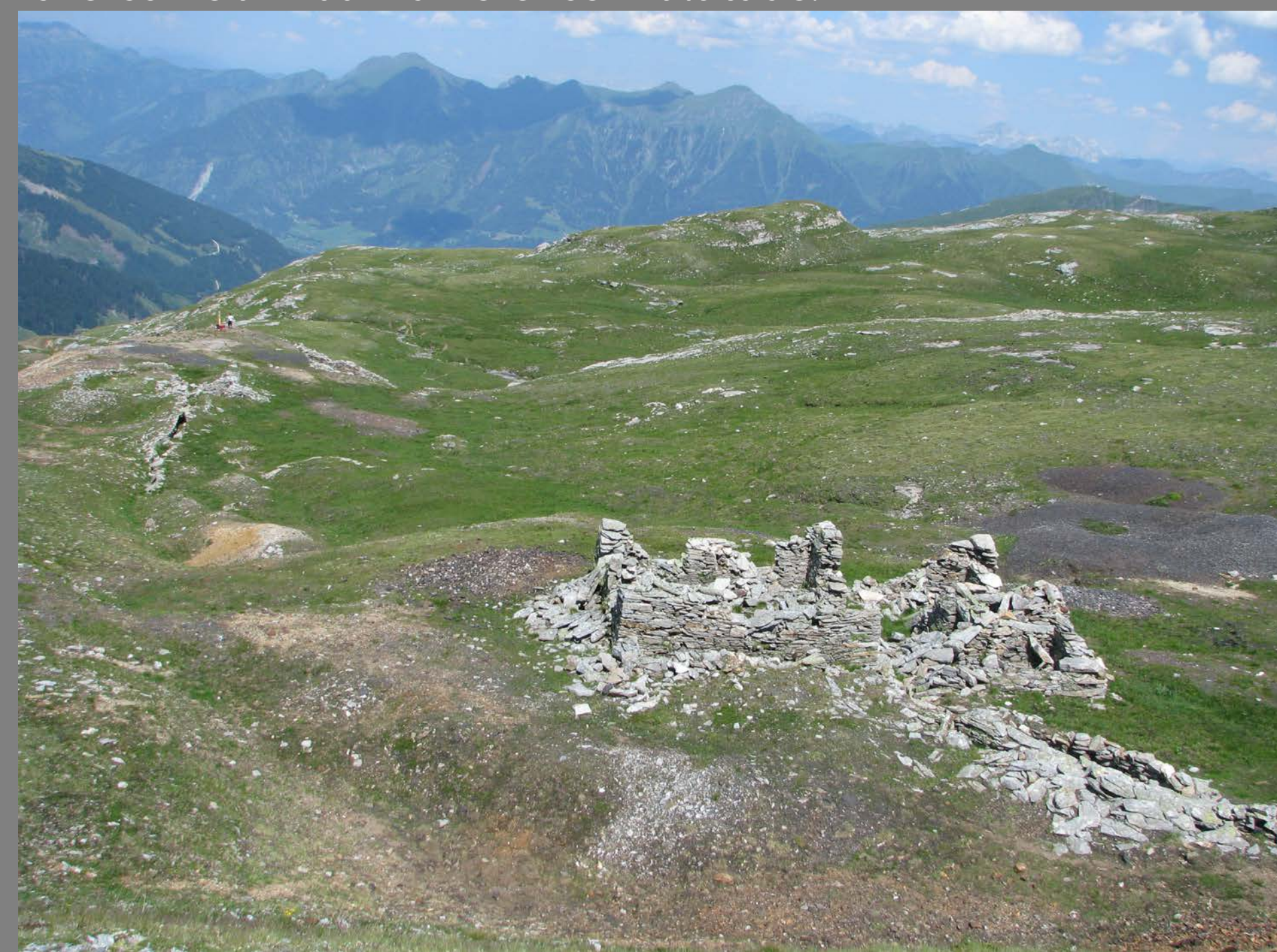
Above: Bad Hofgastein, Erzwiese, two mining sites with a mine-worker's building (residence and working site) and a border pathway to the tunnels (so-called Schneekragen); the stark areas derive from mine dumps; 15th – 16th century (Photo: Cl. Theune).

Gold-mining : An Area of approximately 50km of gold deposits streches over the Tauern region, located between 2000 and 2500m contour. The mining conditions in this area were difficult, but the occurrence of lead deposits was a big advantage for the gold mining industry, since lead is an important component of the smelting process. The written sources and archaeological record show that the deposits were exploited from the 14th century until the end of the 16th century. Peasants, craftsmen, tradesmen and various authorities were involved in the complex economic processes at various levels. The mining process was conducted in the high Alpine region, the different melting workshops were situated in high valleys between 1200 and 1300m contour, resp. on 860m contour. In order to sustain mining throughout the year it was necessary to assure the continuous supply of the people working in the mines with food, clothes, tools and work materials. The transport of the ore and the sustenance had to overcome a 1700m difference in altitude.